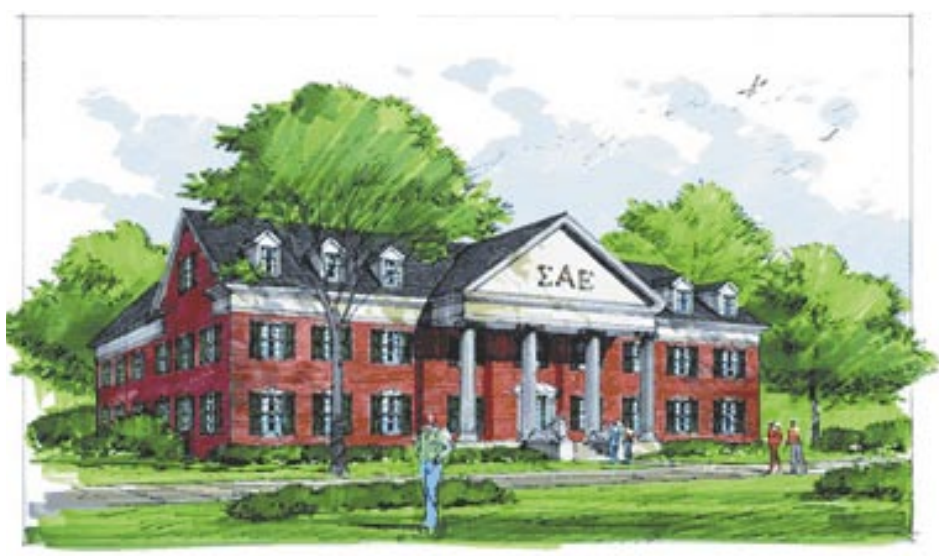
The new Texas Delta Chapter House opening in Fall 2005.

As we look back on the great fraternity experience that we all had as well as many others, this new House will give SAE and SMU a chance to ensure that same opportunity for future SAE's. We need to raise $1.5