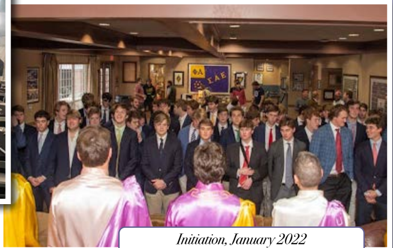
Initiation, January 2022 SAE House