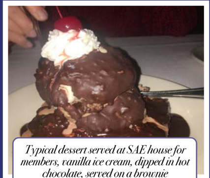
Typical dessert served at SAE house for members, vanilla ice cream, dipped in hot chocolate, served on a brownie