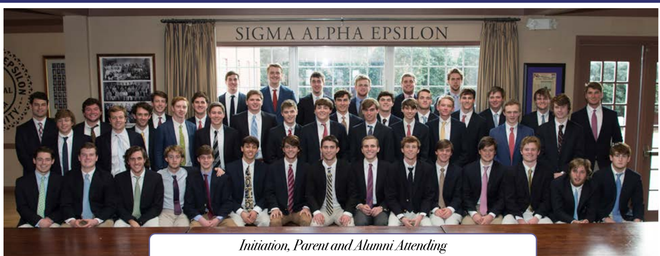
Initiation, Parent and Alumni Attending New Class Celebration - SAE House - January 25, 2017