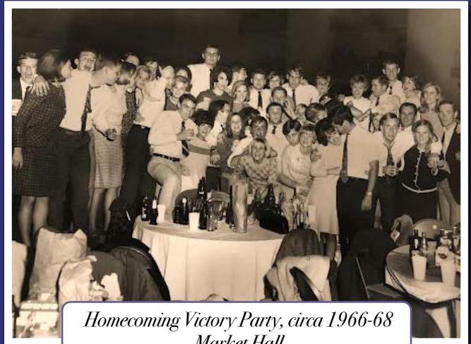
Homecoming Victory Party, circa 1966-68 Market Hall Celebrating beating Texas again Note: BYOB Era on tables