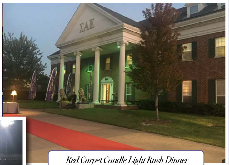
Red Carpet Candle Light Rush Dinner SAE House every Year Since 1974