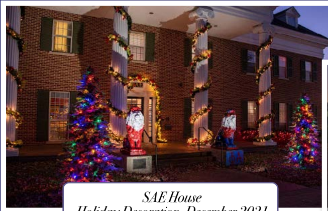
SAE House Holiday Decoration, December 2021