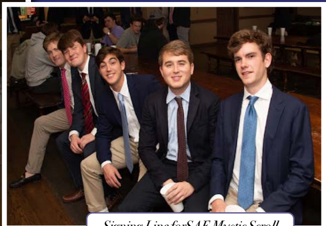
Signing Line for SAE Mystic Scroll January 2022