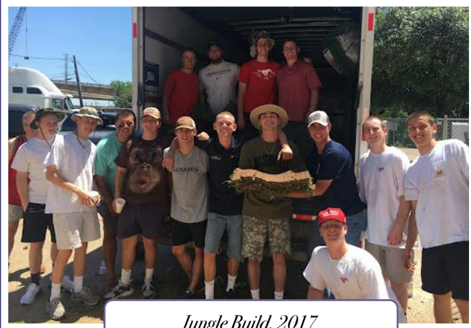
Jungle Build, 2017