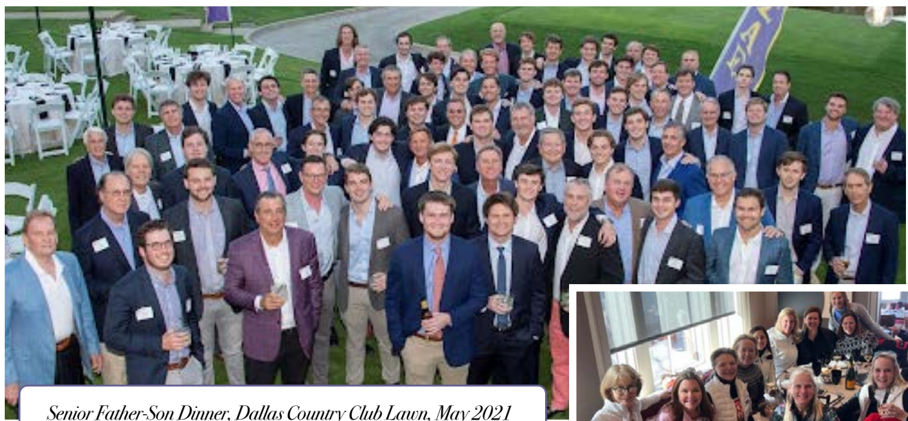
Senior Father-Son Dinner, Dallas Country Club Lawn, May 2021