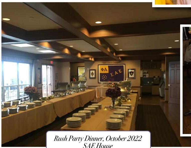
Rush Party Dinner, October 2022 SAE House