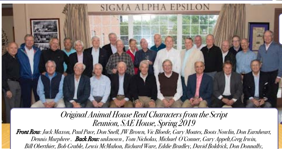
Original Animal House Real Characters from the Script Reunion, SAE House, Spring 2019