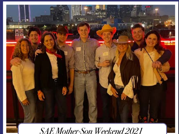
SAE Mother-Son Weekend 2021 Giley's - Dallas