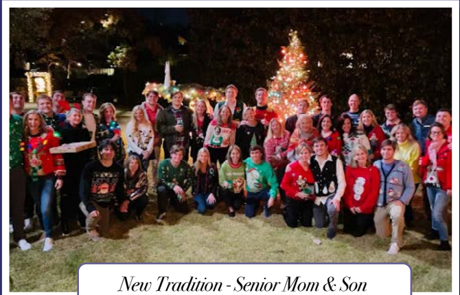
New Tradition - Senior Mom & Son Ugly Sweater Party Weekend of Lighting Candles at Dallas Hall - December 2021