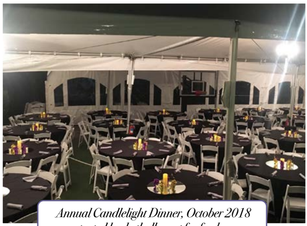
Annual Candlelight Dinner, October 2018 on tented basketball court for freshman and their dates